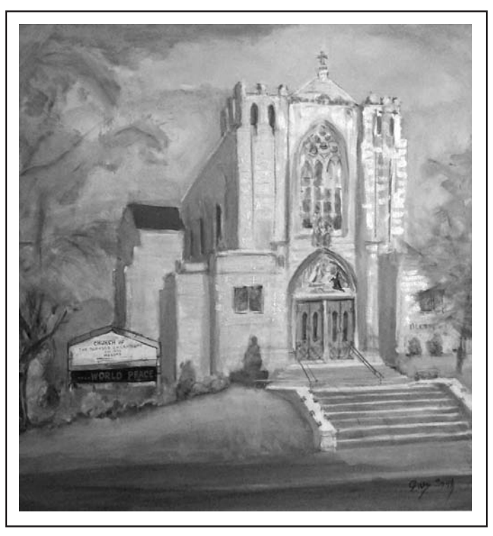
Parish established in 1926, Church erected 1929 Original painting by Gary Smith