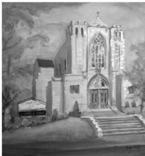
Parish established in 1926, Church erected 1929 Original painting by Gary Smith